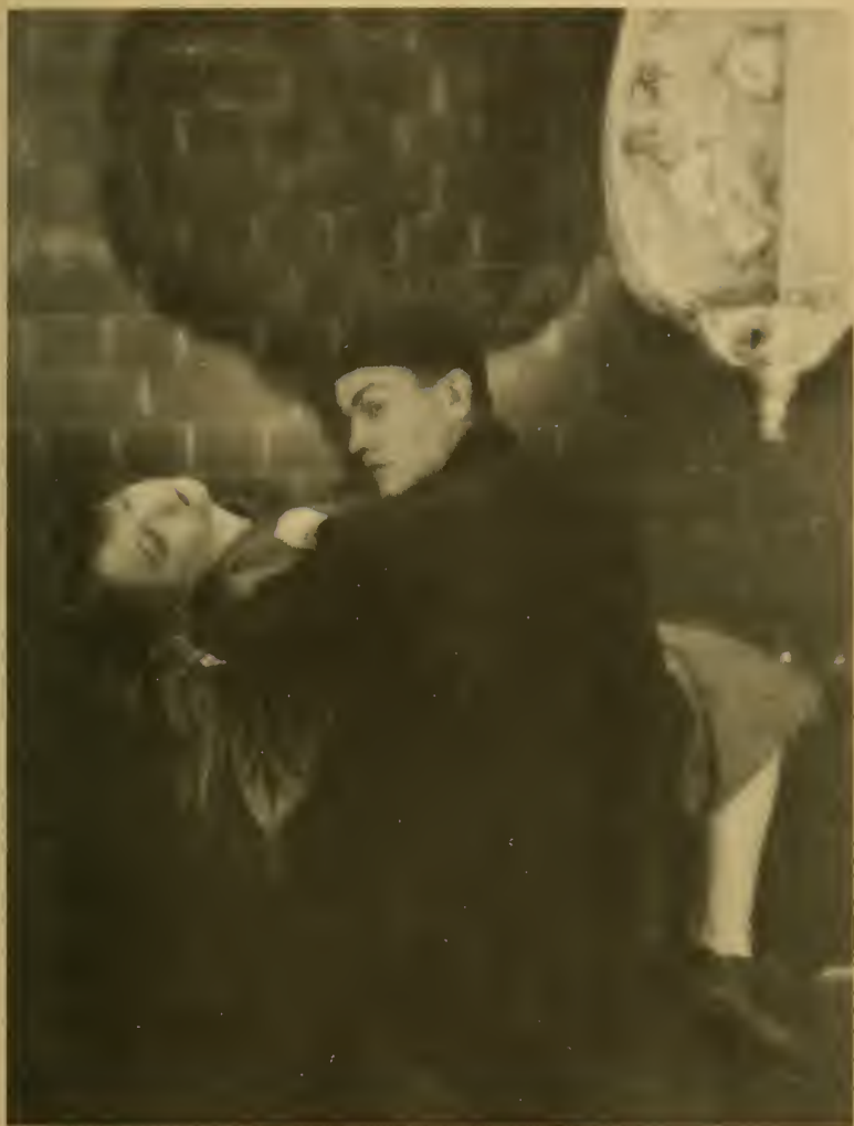
LILLIAN GISH AND RICHARD BARTHELMESS IN "BROKEN BLOSSOMS"